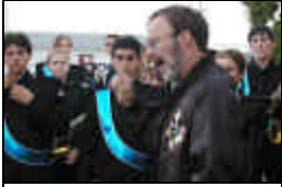
From the Director...