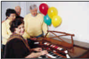
Photo used for illustrative purposes only. This is not the actual organ. Family members not included!

Kawai organ: approximately 25 years old in excellent, like new condition. One owner. 37 inches high, 44 inches wide and 25.5 inches deep. Includes bench, music and stand light with roll-top cover. 3.5 octaves lower and upper keys, one octave foot pedals. Interested parties should contact Shelley Zollner at mzollner@itt-tech.edu or call her during the day at 412-856-5920.