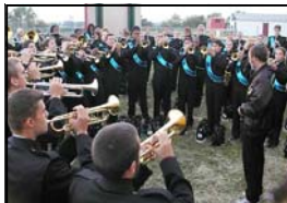
From the Director...