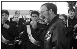
From the Director...